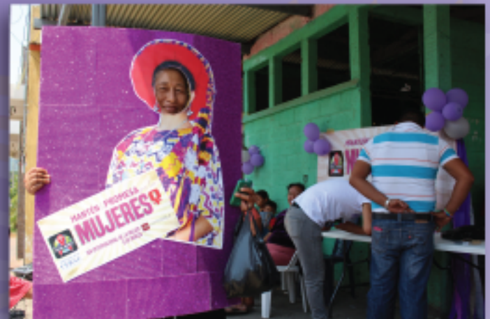
AHF Guatemala uses social media and grassroots events to commemorate International Women's Day.