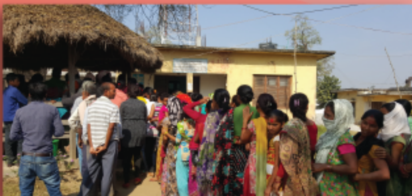
Line to get tested for HIV in Nepal during International Women's Day.