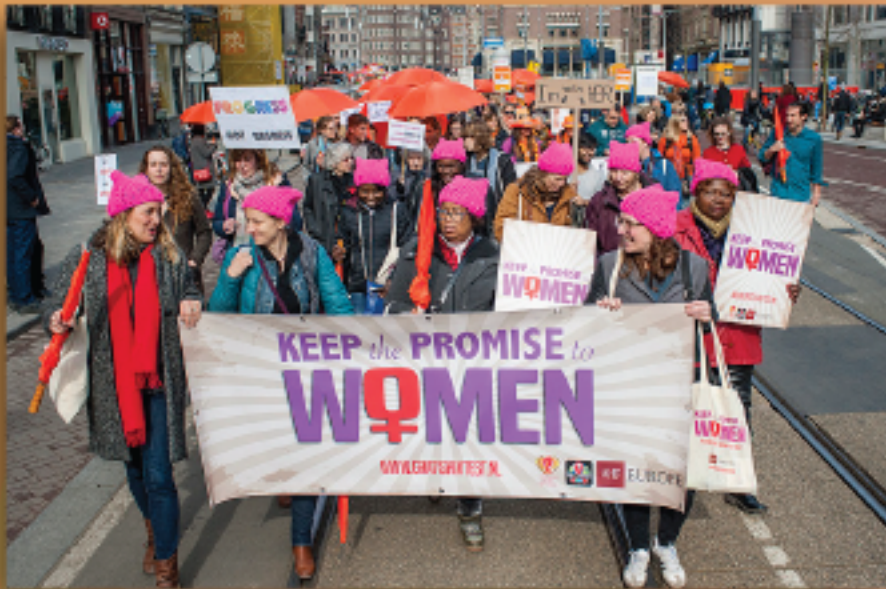
Women march in Amsterdam, Netherlands to raise awareness about women's rights on International Women's Day.