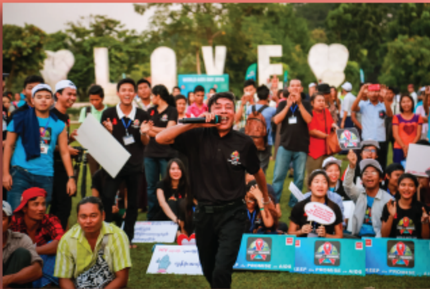
AHF event in Myanmar attracts passersby and advocates commemorating World AIDS Day.