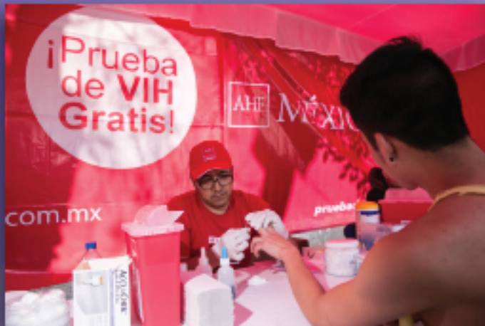
AHF Mexico provides free rapid HIV testing and LOVE Condoms during International Condom Day.