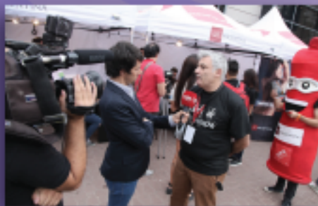
AHF Argentina performs 1,200 rapid HIV tests during the Buenos Aires Tattoo Show.