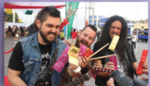
AHF-sponsored concert in Lima, Peru on International Condom Day.