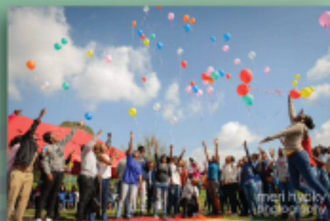
AHF and partner organizations mark the "Day Against Homophobia" in Lesotho.