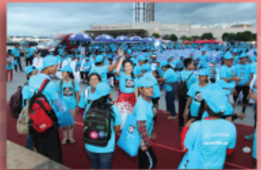
Free "Keep the Promise" concert in Phnom Penh during World AIDS Day.