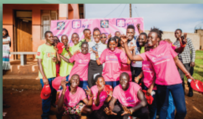
AHF Uganda Cares hosts a Girls Act Campaign event to empower young women and girls to pursue their dreams and stay healthy.