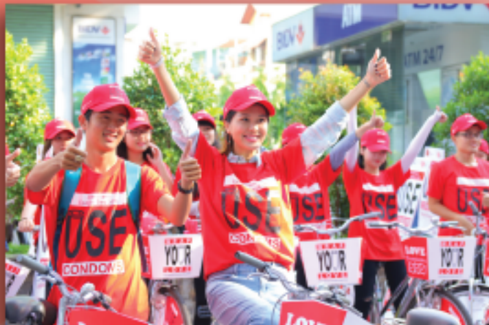
Bicycle riders in Vietnam distribute AHF-branded LOVE condoms on International Condom Day.