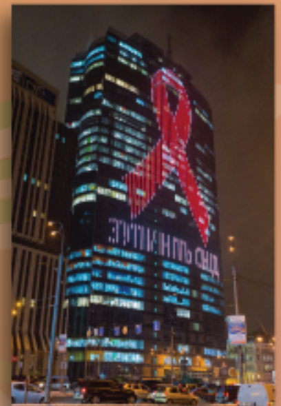
A digital projection of AHF's "Keep the Promise on AIDS" Campaign logo in Kyiv.