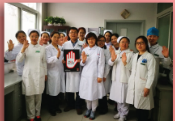
Commemoration of International TB Day in China.