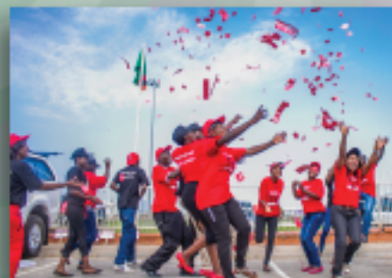
AHF Zambia marks International Condom Day with safer sex awareness activities across the country.