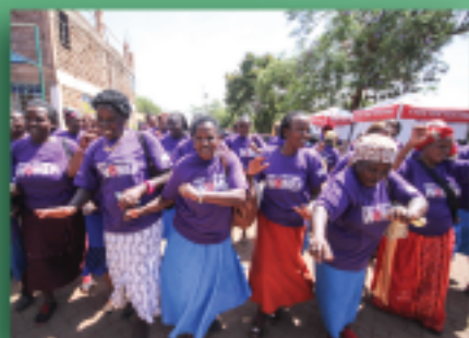
Women march in Nairobi, Kenya to commemorate Int'l Women's Day 2017.