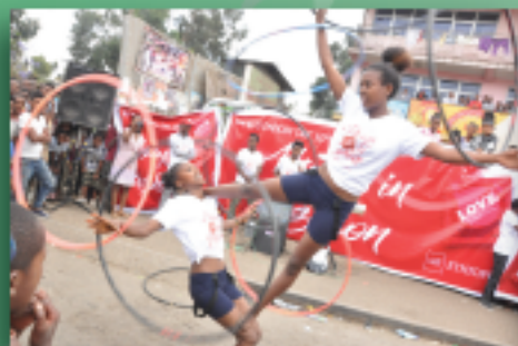
Performers in Addis Ababa, Ethiopia at a condom promotion event during International Condom Day.