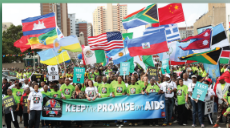
AHF's "Keep the Promise Free March & Concert" in Durban, South Africa in July 2016.