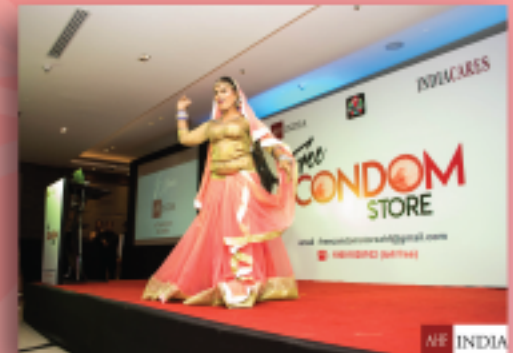
Launch event for the virtual AHF Free Condom Store in India.