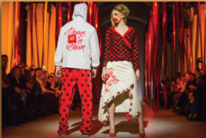
AHF Ukraine hosts a fashion show featuring couture made of condoms.