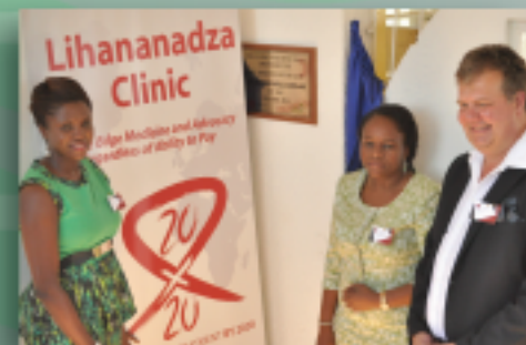
AHF opens a new clinic in Swaziland together with the government and Peak Timbers Company.