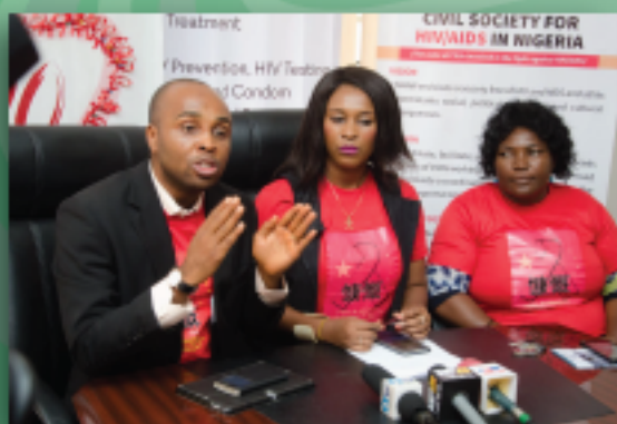
AHF Nigeria hosts a press conference urging China to contribute $1 billion to the Global Fund.