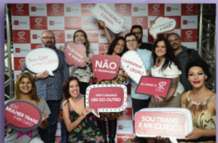
AHF Brazil launches a transgender campaign to fight transphobia in Brazil.