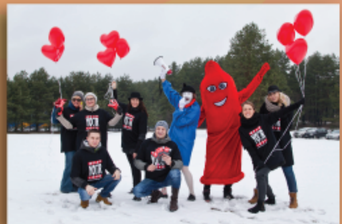
AHF staff and the LOVE Condom mascot distribute condoms in Lithuania during International Condom Day.