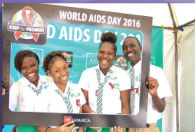
AHF Jamaica tailored World AIDS Day activities to educate the youth about HIV/AIDS.