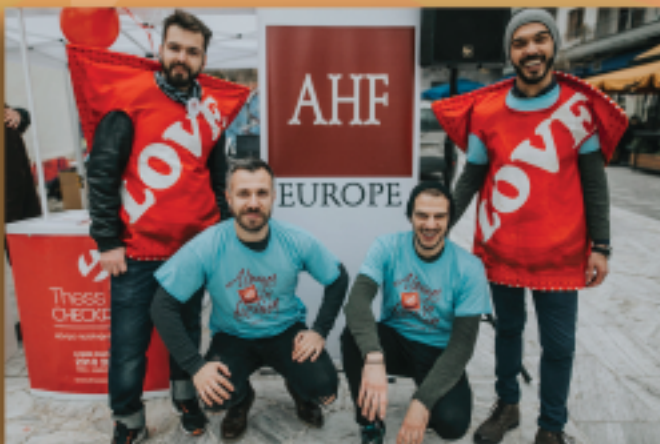
AHF distributes thousands of free LOVE Condoms in Greece during International Condom Day.