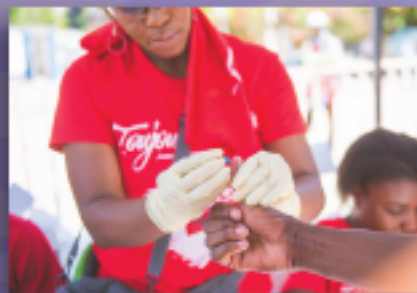
A community testing point setup by AHF Haiti during International Condom Day activities.