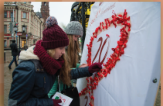
Passersby in St. Petersburg, Russia pin ribbons to commemorate World AIDS Day.