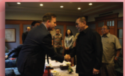
AHF meets with Indonesian officials on future HIV/AIDS policy