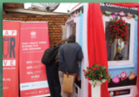
The first 24-hour condom distribution kiosk opens in Kigali, Rwanda.